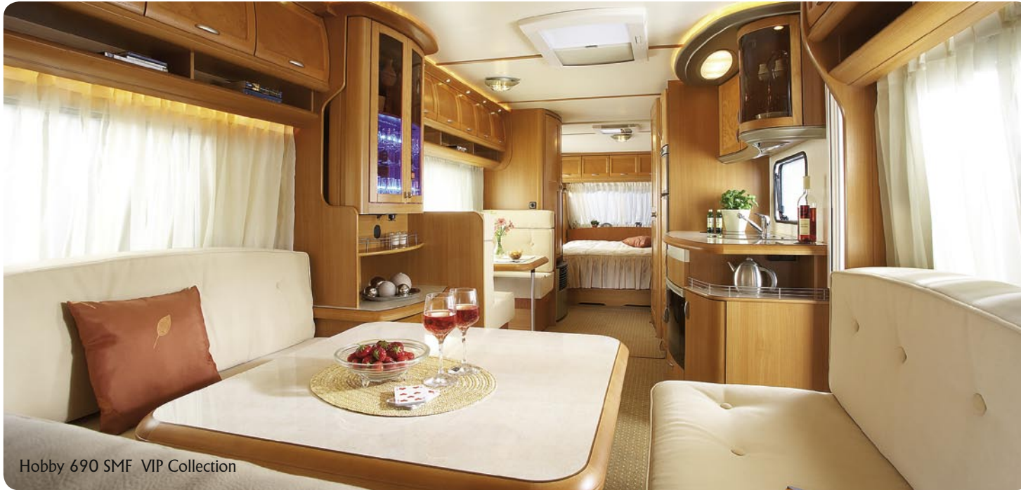
Hobby 690 SMF VIP Collection

The Hobby UK Special offers the highest comfort in the History of Hobby Caravanning. Absolutely fully equipped with highest standards of design and quality down to the smallest detail. Move in and enjoy the atmosphere of the latest interior decor and design. The Hobby 570 SMF, 640 SMF and 690 SMF VIP Collection exemplifies how wonderful life on the road with luxury furnishings can be.